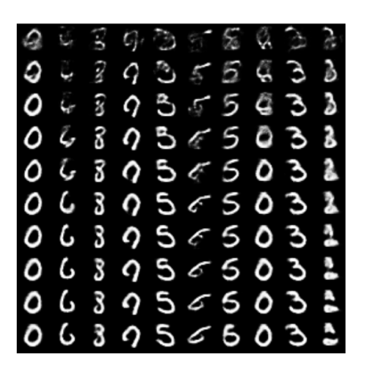
Figure 2. Visible layer initialized to 10 examples from triangle dataset. Sampled after every 2 Gibbs cycles on Diss-CD trained net.

In summary, Diss-CD provides a novel method to train effective anomaly detectors without departing too much from the traditional method of training RBMs. Furthermore, these networks show themselves to be better generative models than their PCD trained counterparts. As such, the source distribution of the training data is better modeled by the Diss-CD method as compared to the PCD method. The use of such networks as generative models should be explored in future. In our observation, the number of Gibbs samplings for gradient calculation while training must be high (\geq 10) as lower values lead to poor performance on datasets other than the training and untraining datasets. In addition, we found that increase in the number of hidden units did not trans-